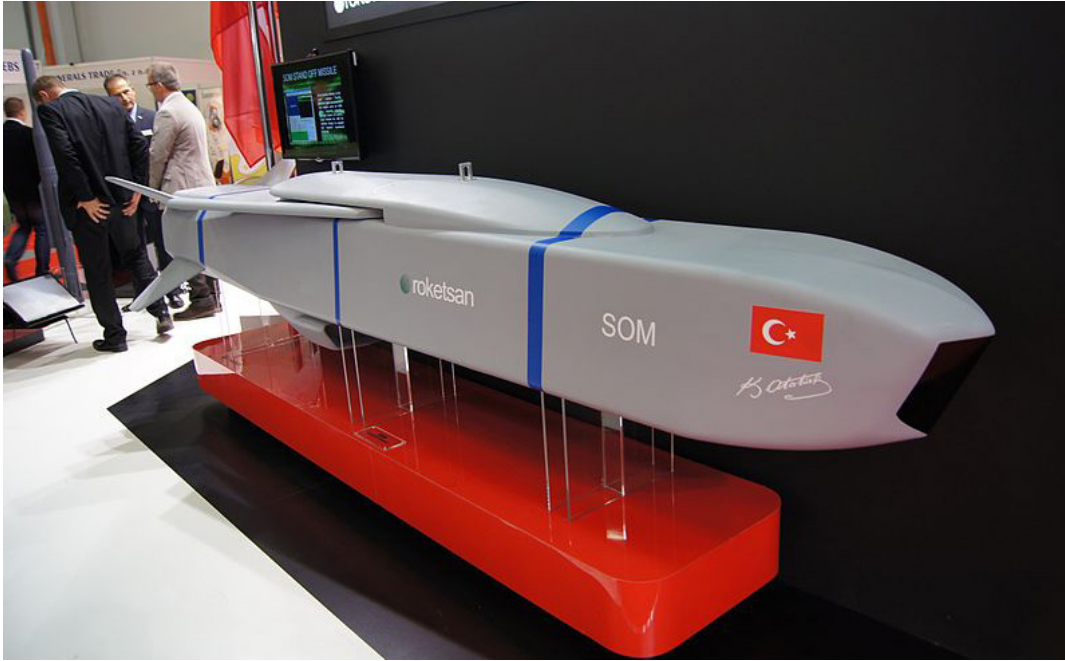
SOM cruise missile mockup on MSPO 2014.

self-reliance in arms -as well as bringing in cash through the export of these weapons.