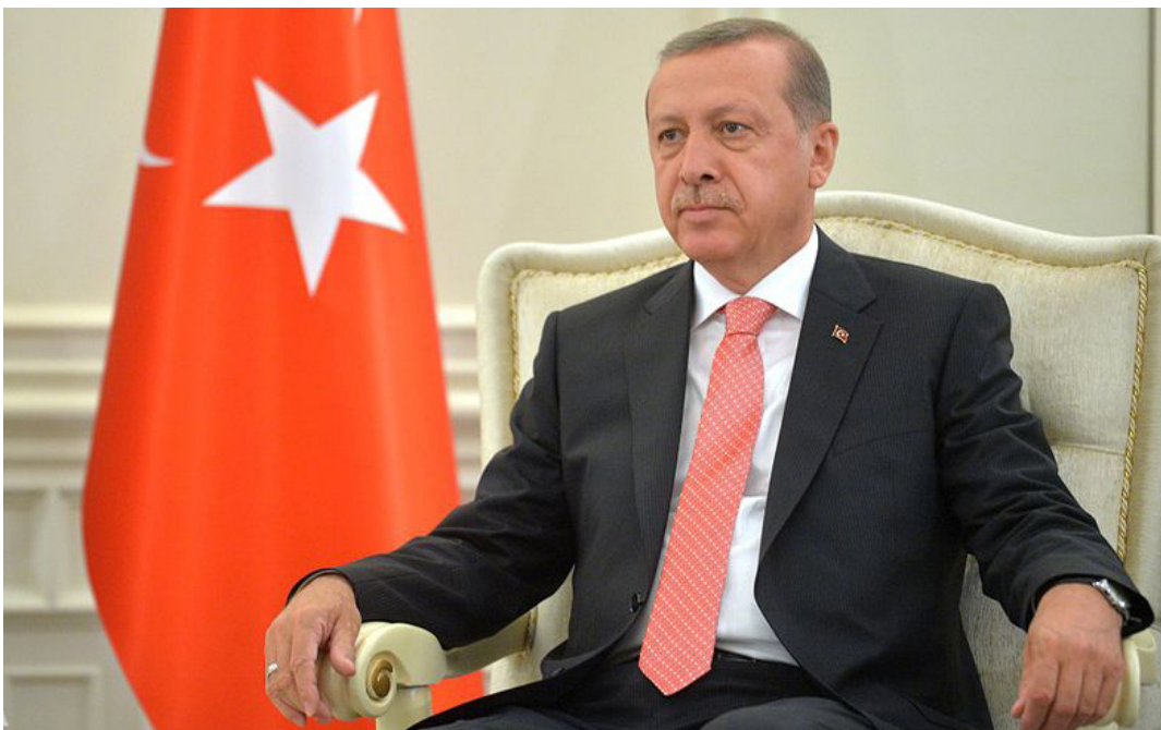
Recep Tayyip Erdoğan.

In naval forces, Turkey's navy (like Greece's) is equipped with German-built diesel submarines for the shallow waters in which they operate. It also fields 16 frigates, (half of these being modernised ex-US Oliver Hazard Perry class), ten corvettes and 19 fast attack craft as its main surface combatants. Under