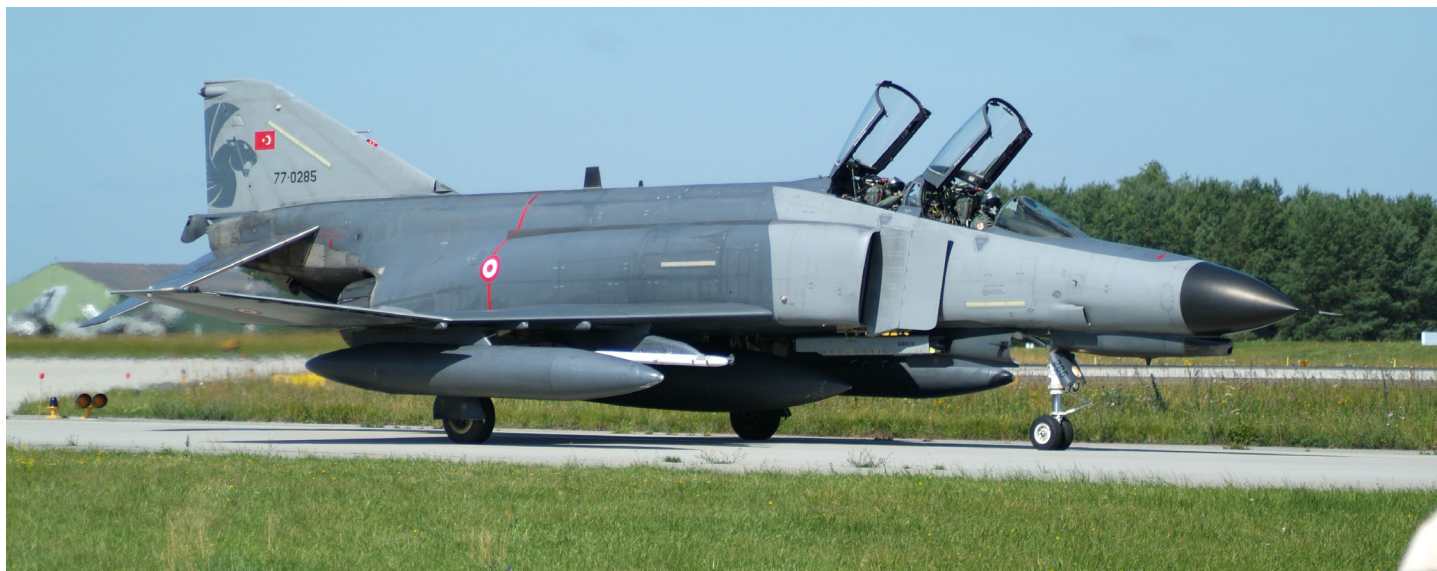
F-4E Phantom ‘Terminator 2020’.

Turkey has also worked to develop its own indigenous aerospace and defence industry - developing its own precision munitions like the SOM air-launched cruise missile, UAVs, trainer aircraft and attack helicopters. It is also pushing ahead with development of its own stealth fighter. This gives it a degree of