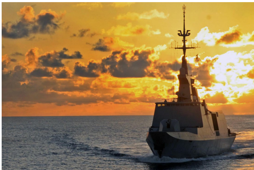
La Fayette Frigate.

arms sales. To its credit, its engineers and technicians have worked wonders to operate, maintain and even upgrade and reverse-engineer US weapon systems first delivered in the 1970s. Some of these have demonstrated high levels of innovation – keeping F-14 Tomcats (probably the IIRAFs most potent interceptor) flying and even adding new capabilities in modified I-Hawk SAMs as AAMs. (It is notable that the vast 'Boneyard' of hundreds of retired US military aircraft in Arizona has only a handful of Tomcats – a clue that the US was keen not to see spare parts be used to keep Iranian F-14s flying). Meanwhile it has also modified its F-4 Phantoms, another relic of the Shah's era to