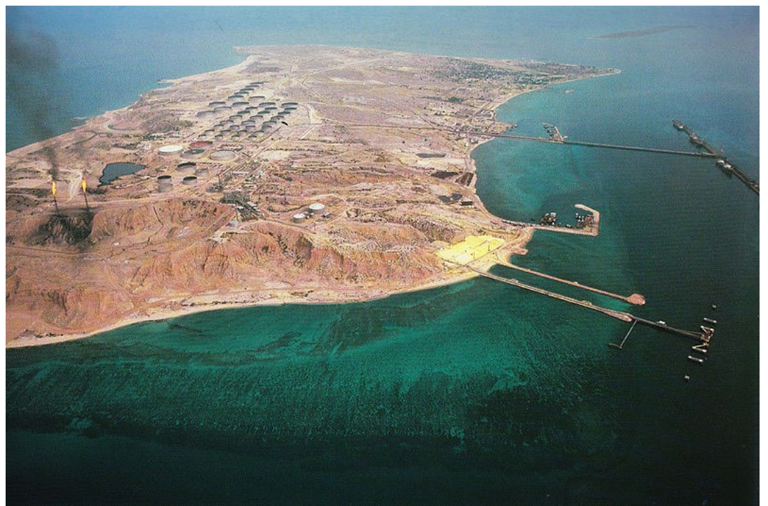
Khark island, Iran.

ignite a wider and direct conflict between these two religiously conservative and muscular regional powers is significant. Absent of the focus of Iran's nuclear programme (now on hold) the most likely targets for each side will be the other country's oil and gas facilities, with the intention of strikes to cripple their overall energy production and therefore income (as was in the Iran-Iraq war). Whether one side can swiftly overmatch the other, or whether this indeed drags on for another 30 years is another question.