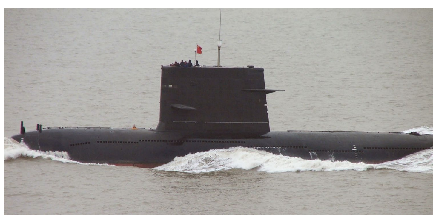
Song class submarine.

As noted above, for anyone wishing to challenge China in its own back yard, the presence of this carrier, supported by 'carrier killer' DF-21Fs, shore-based long-range SAMs and long-range missiles, aircraft along with sub-amrines means that the A2/AD challenge is becoming progressively much tougher.