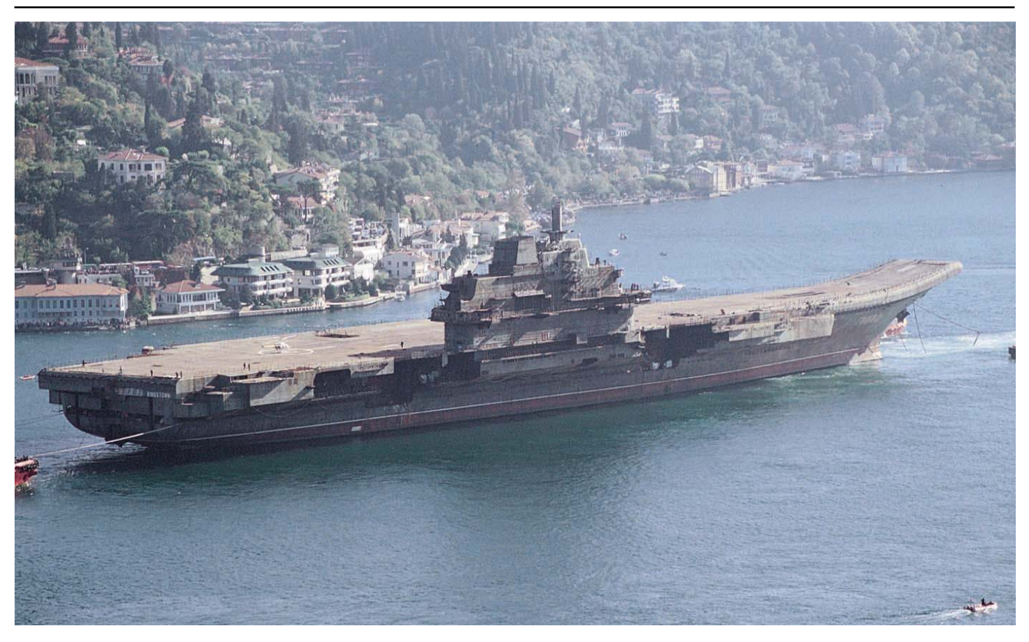
Liaoning before refurbishment.

a new leader. Ominously, following the PCA's ruling in August, it was reported that China's defence minister had warned the country must prepare for a 'People's war at sea'.