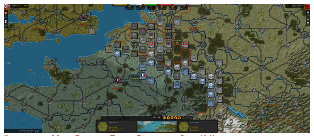
SITUATIONAL MAP – PRIOR TO ENEMY RESPONSE – JUNE 1940