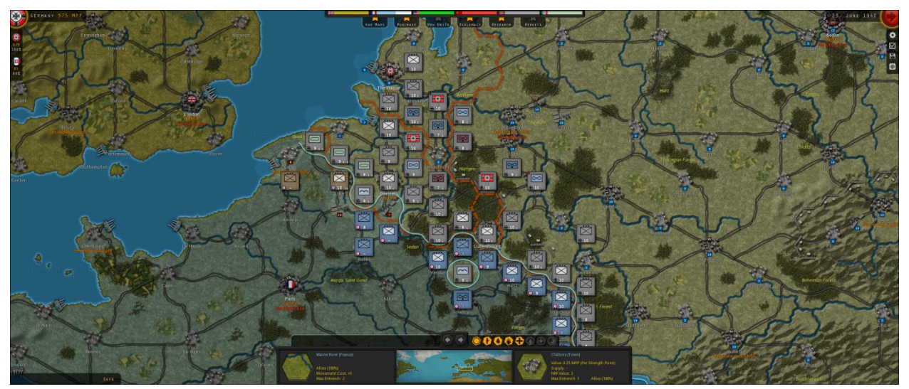
SITUATIONAL MAP – 1010 HRS 23 JUNE 1940