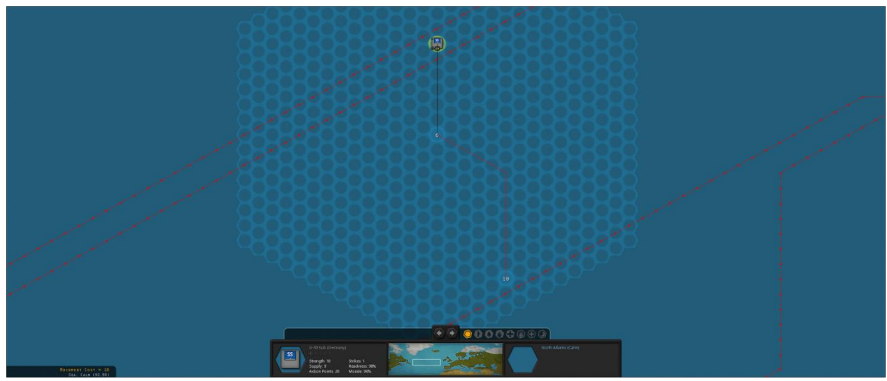
FIGURE 10 - NAVAL MOVEMENT BY WAYPOINT