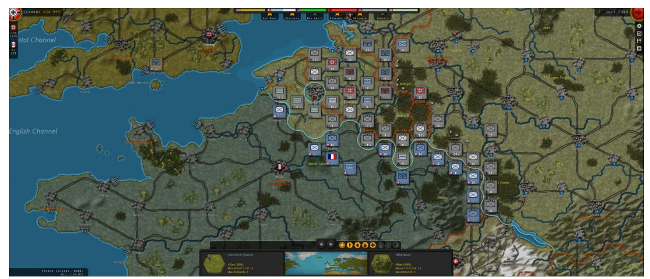
SITUATIONAL MAP - 7 JULY 1940