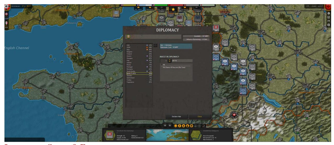
INFLUENCE SPAIN & FINLAND